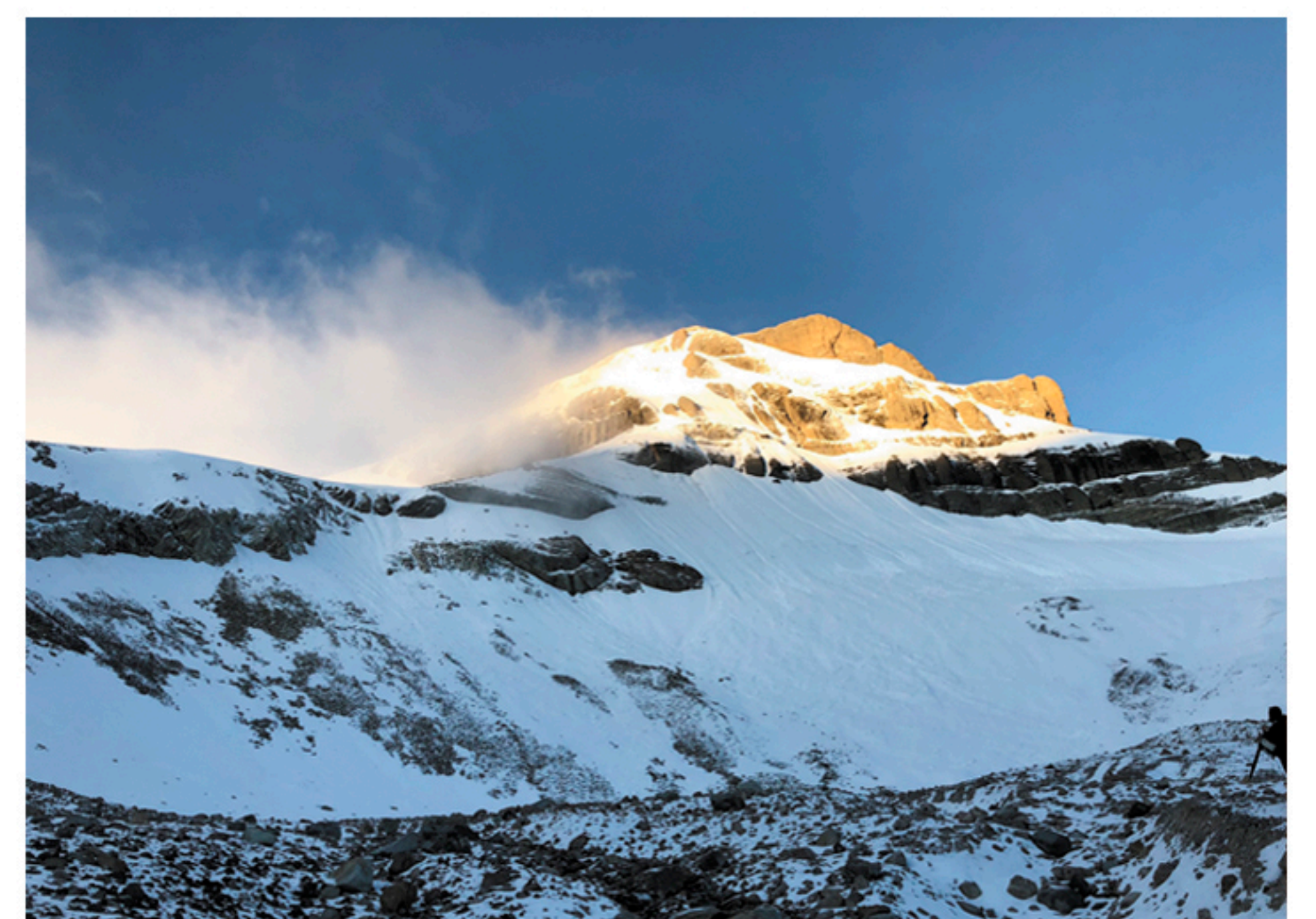
KAILASH MANASAROVAR BY LHASA 15 Days / 14 Nights