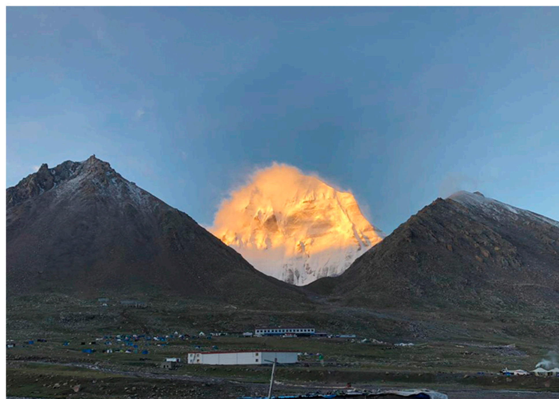
KAILASH MANASAROVAR BY OVERLAND 14 Days / 13 Nights